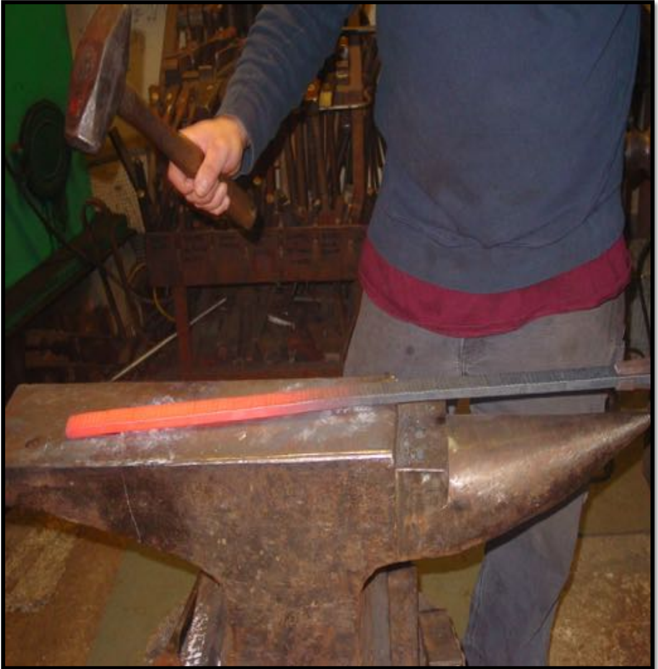
This image shows one of our blacksmiths working on the big shop anvil made in the late 19th century. He straightened the steel bar that was textured in our power hammer with our special tooling.