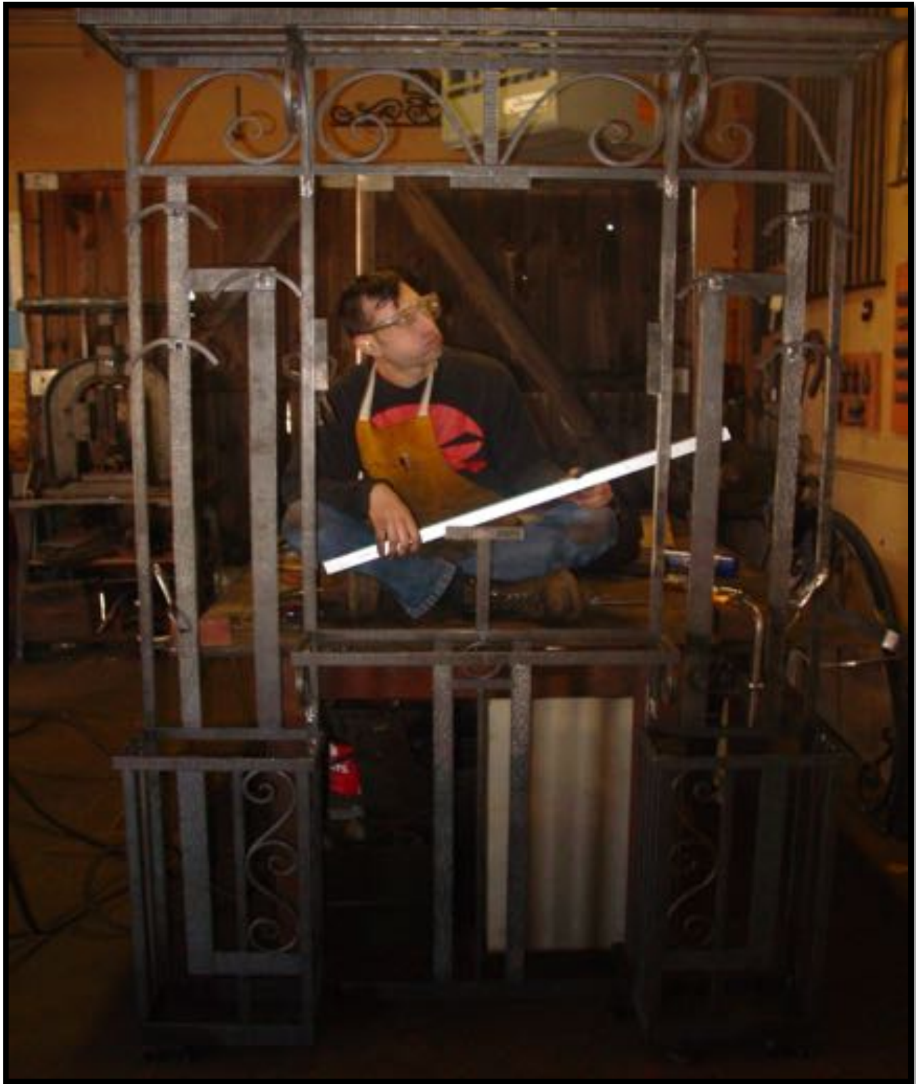
Here is our fabricator tired after a long day of working on the coat rack. This photo shows the piece in its final stage. Lots of overtime was worked in order to meet the client's tight deadline.